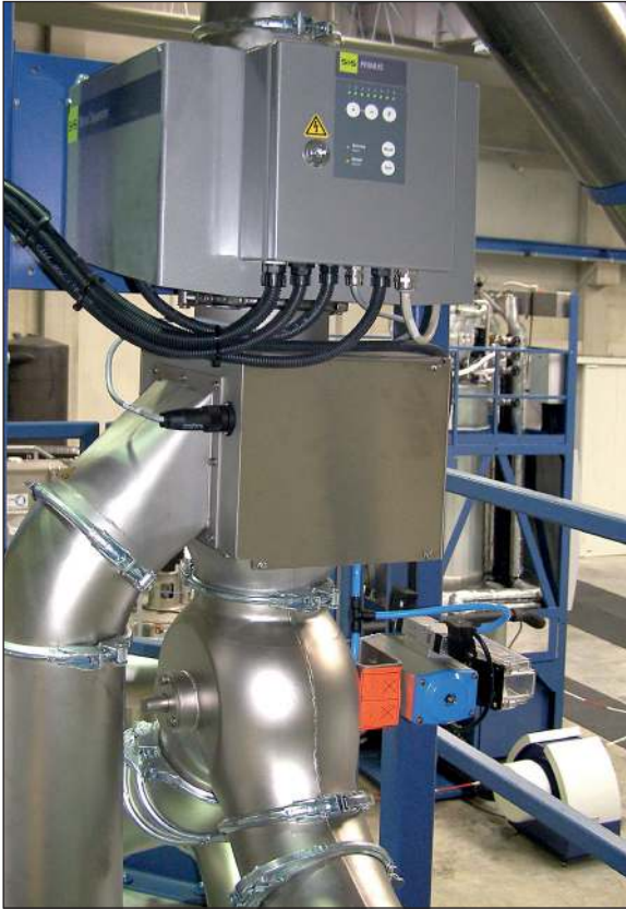
Installation example: Metal separator RAPID VARIO-FS used for the quality control of PET regenerate. (old version)