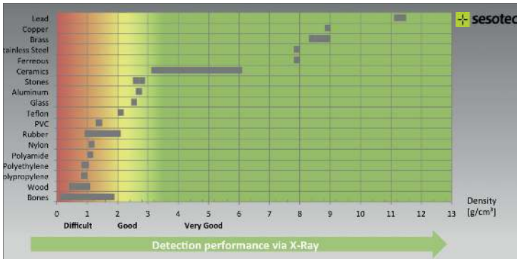
Detectability of different materials depending on their density

The RAYCON 130/240 product inspection system detects all contaminants that due to their density, chemical composition, or mechanical dimensions absorb X-rays better than the surrounding product. For example this applies to metal, glass, ceramic, and stone contaminants in food materials. The RAYCON system also detects some types of plastics (e.g. PVC, rubber) as well as other product defects (e.g. trapped air, filling level).