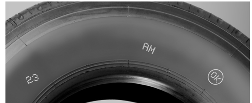
High impact codes in red, yellow, blue and white