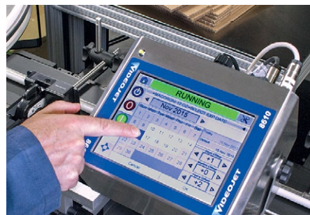
CLARiTY™ interface on Videojet printers

All Videojet solutions operate with one common and inherently simple user interface. The brightly colored CLARiTY™ touchscreen makes operating any Videojet product quick, easy and almost impossible to get wrong. The built-in Code Assurance software helps prevent human errors during data entry, and the menu structure offers intuitive navigation to reduce training requirements, so that all of your operators can feel confident during job set ups or changeovers.